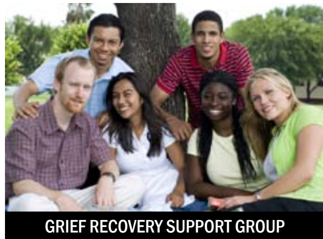
GRIEF RECOVERY SUPPORT GROUP

We also offer a program for children of divorced families, ages 5 to 12. These children will find healing and encouragement, and develop coping skills during this difficult time in their lives. DivorceCare for Kids (DC4K) meets at the same time as the adult DivorceCare group.